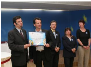
Vienna, may 2009