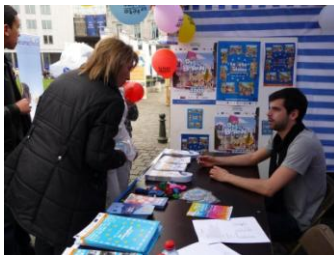
Neighbours Day stand - FESP