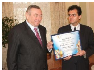
Odessa, april 2009